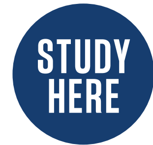
6" DESK/FLOOR DOT