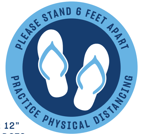
10" & 12" FLOOR DOTS