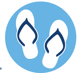
4" FLOOR DOTS